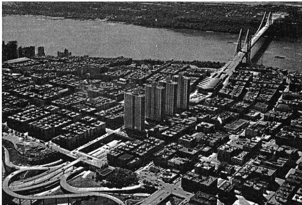
Figure 4. One of the first aerial images of the Washington Bridge Apartments.

concluded that the pollution level in the area was 'undesirable' but 'not dangerous'. 15