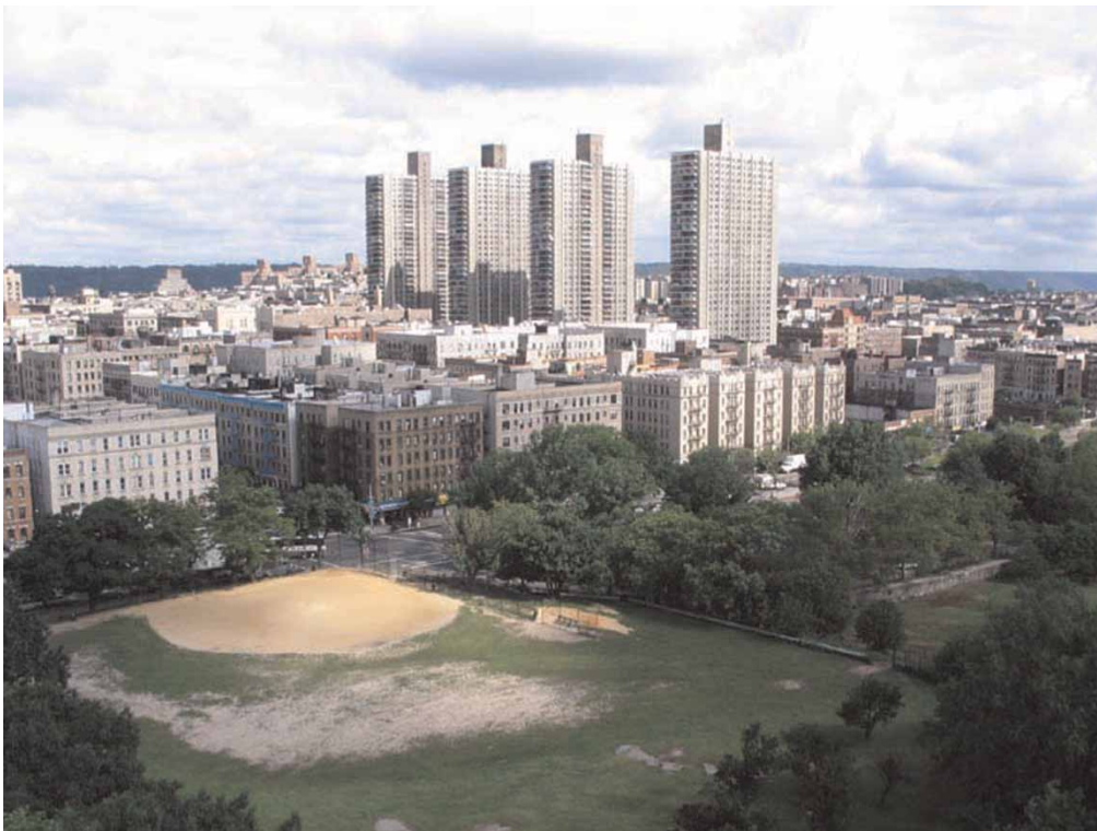
Figure 5. The Washington Bridge Apartments today.

As developments such as Confucius Plaza circulated in the city's popular and architectural press, the problems of the Washington Bridge Apartments were being forgotten by both the Municipality, State and Federal oversight agencies. Following a rent strike in the early 1970s that protested about the deteriorating conditions in the building, many of the middle-class residents quickly departed. In the ensuing years the residents of the Bridge Apartments