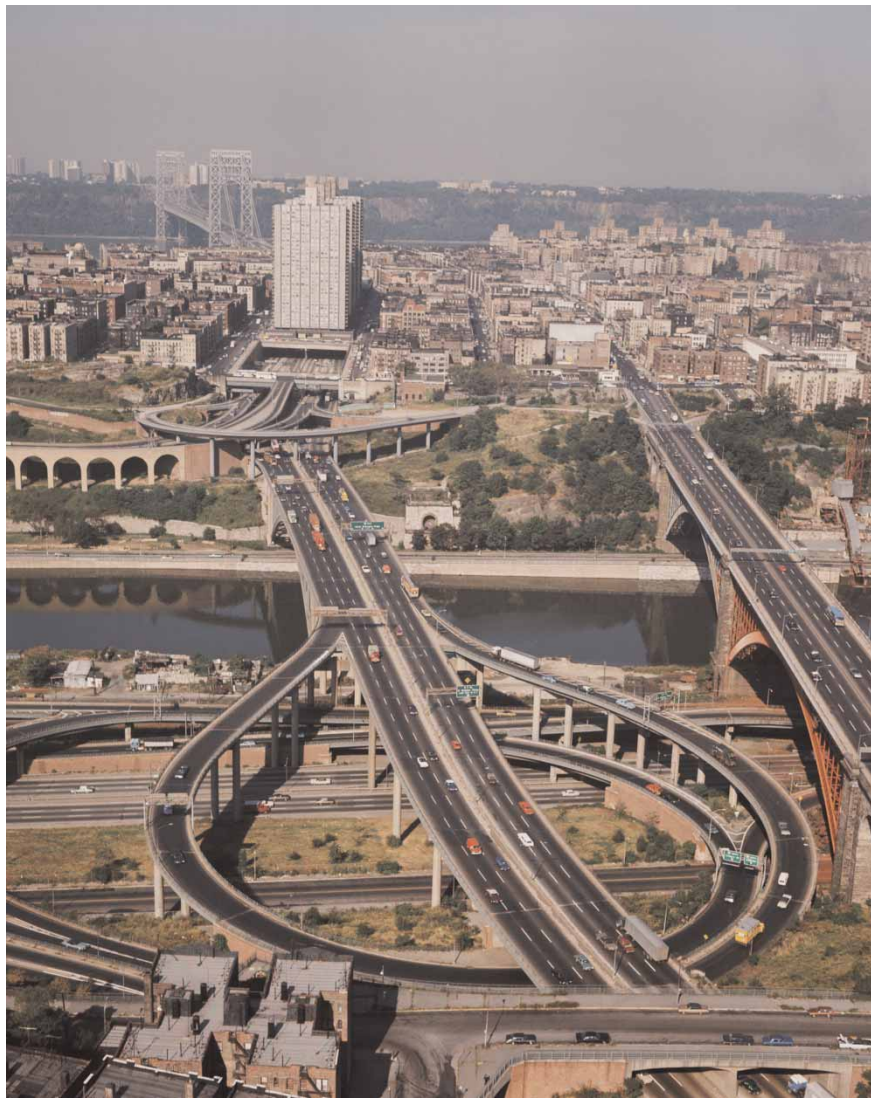
Figure 1. The Washington Bridge Apartments over the Trans-Manhattan Expressway shortly after completion.